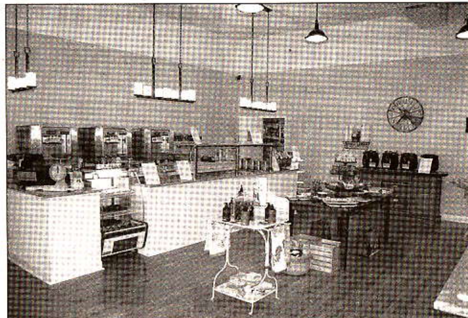
The interior of Cravings Eats & Treats, where you can relax with a delicious soup, salad or sandwich for lunch in a country atmosphere.

Perhaps one of the biggest treats is car-